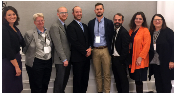
CUB Staff at the 2017 CUB Policy Conference, Utility Regulation 2.0: Empowering What's Possible

In April, Portland City Council approved a Bureau of Environmental Services plan to turn unused methane from the Columbia Boulevard waste treatment facility into renewable natural gas. This decision was made, in part, because CUB offered astute analysis showing the high economic return to the City and the greenhouse gas emission reductions provided by capturing methane from the waste. Learn more at bit.ly/2017-Money-Methane .